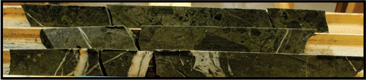
Figure 1. Cut diamond drill core, hole TM-21-108 from 9.5 m to 11.0 m (1.5 m) grading 11.4 g/t Au.